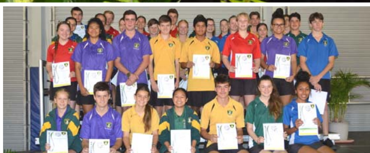
YEAR 10 AWARDS