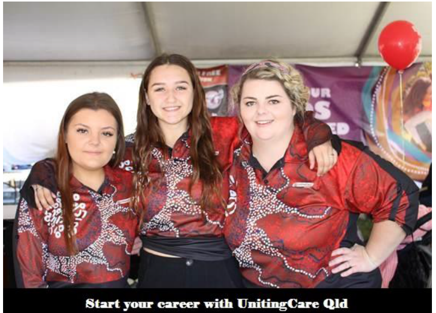
Start your career with UnitingCare Qld

UCQ considers in an inherent requirement of this role that the successful applicant for this role Identify as Aboriginal and/or Torres Strait Islander and/or South Sea Islander under S25 of the Anti-discrimination act 1991 (Qld)