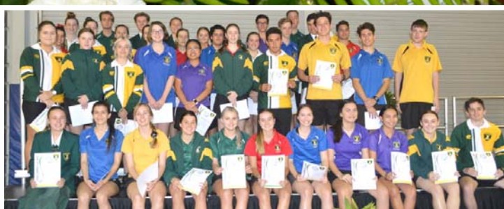
YEAR 12 AWARDS