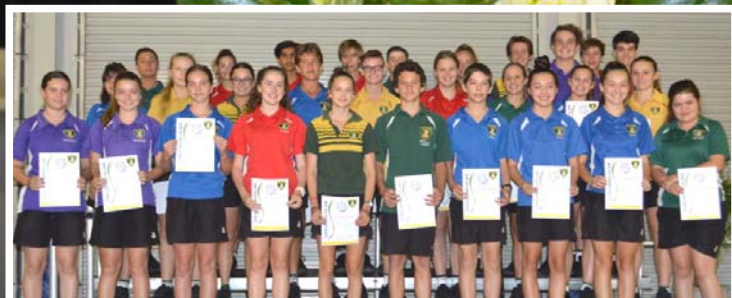
YEAR 9 AWARDS