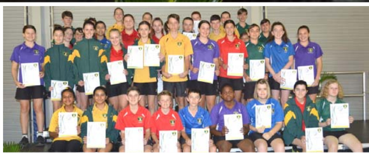
YEAR 8 AWARDS