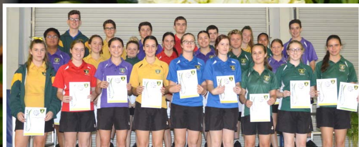
YEAR 11 AWARDS