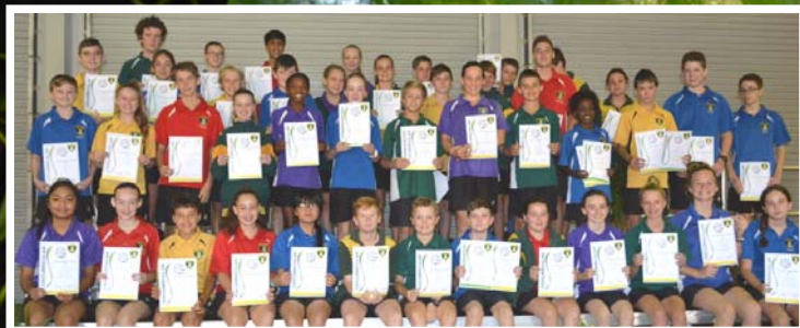
YEAR 7 AWARDS